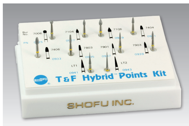
The T&F Hybrid Points Kit contains all 10 shapes.